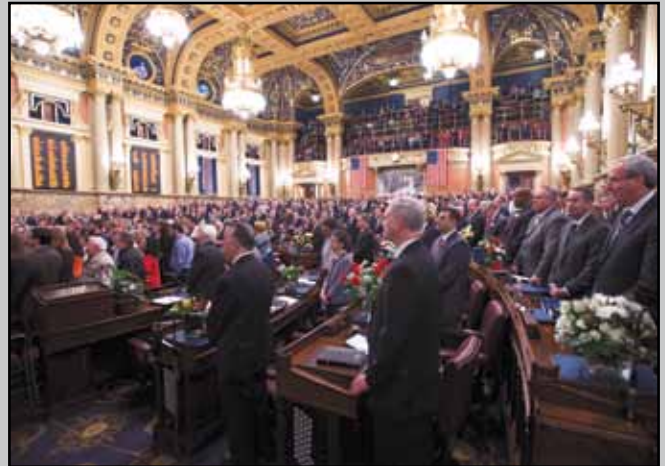
Pennsylvania lawmakers took the oath of office for the 2015-16 legislative session on Tuesday, Jan. 6. The ceremony marked the beginning of the 199th session of the General Assembly.